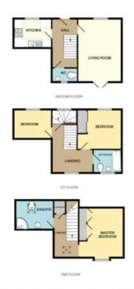
This Floor Plan is for guidance only and is NOT to SCALE Made with Metropix ©2019